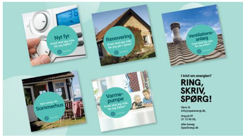
Figure 3. Sample of popular guides targeting private households.

The Danish Energy Agency's website www.SparEnergi.dk is the backbone of communication with end users concerning energy efficient solutions, both in private households and in public and private enterprises. The website contains a variety of tools, information and knowledge that supports energy saving. The Danish Energy Agency also offers free-of-charge telephone support and email advice, as well as information activities about available energy-consulting services for private households.