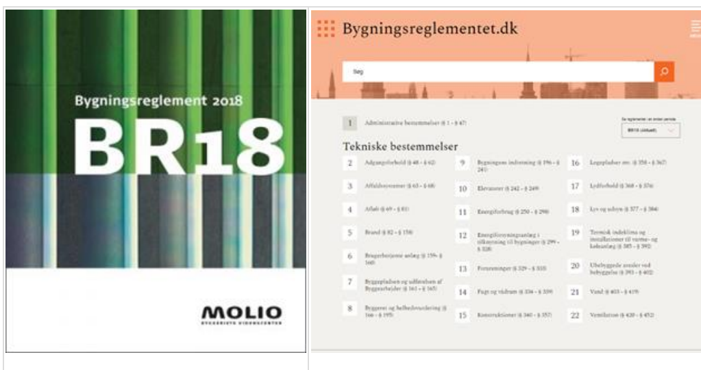
Figure 1. Danish Building Regulations 2018. The Danish Building Regulation (current and historic) can be found at: http://bygningreglementet.dk .

In July 2016, the previously voluntary 'Low-energy Class 2015' became final and binding and was renamed the 'Danish Building Regulation 2015 (BR2015)'. The BR2015 sets minimum energy performance requirements for all types of new buildings. In addition to the minimum requirements, the BR2015 also sets requirements for a voluntary low-energy class, 'Building Class 2020' (equivalent to NZEB level at that time). In 2018, the energy performance requirements were slightly changed, primarily due to upgrades of the primary energy factors and the calculation procedure, and were implemented in the Building Regulation 2018 (BR2018). The voluntary class of 2020 was evaluated to be beyond the cost-optimal level and will remain a voluntary low energy class with a small change in the requirements due to updated primary energy factors.